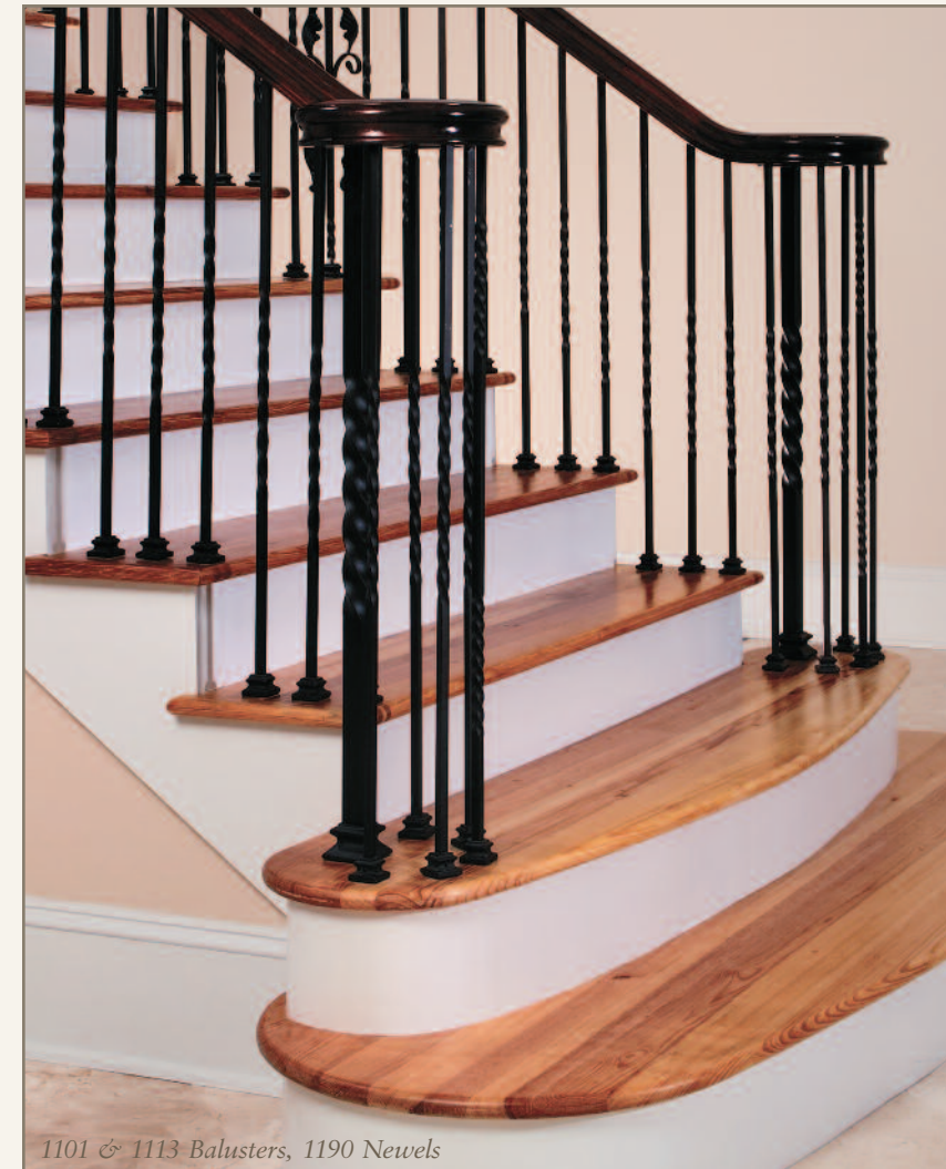
1101 & 1113 Balusters, 1190 Newels

The Transformer System. The Industry's First Baluster Replacement System. See page 25