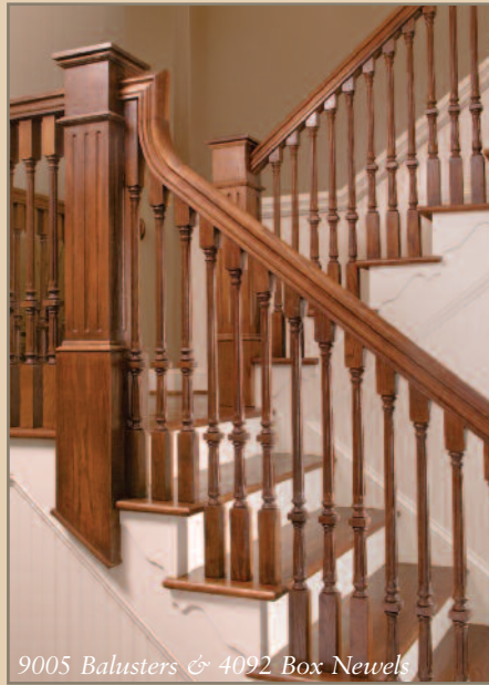
9005 Balusters & 4092 Box Newels